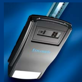
tousek garage doors operators convenient and safe