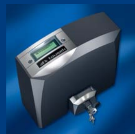
tousek sliding-gate operators compact and safe