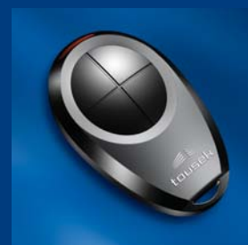
tousek impulse emitter programmes compatible and secure