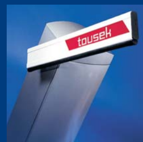
tousek barrier systems attractive and robust